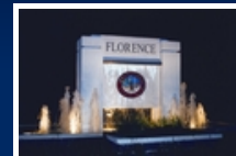
Pee Dee Regional Office McMillan Federal Building 401 West Evans Street, Suite 111 Florence (843) 669-1505