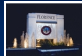
Pee Dee Regional Office McMillan Federal Building 401 West Evans Street, Suite 111 Florence (843) 669-1505