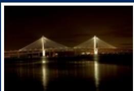
Lowcountry Regional Office 530 Johnnie Dodds Boulevard, Suite 202 Mt. Pleasant (843) 849-3887